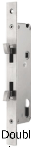
85 Double Channel Single point