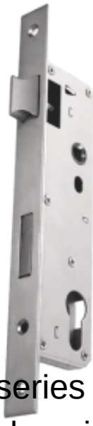
85 series single point